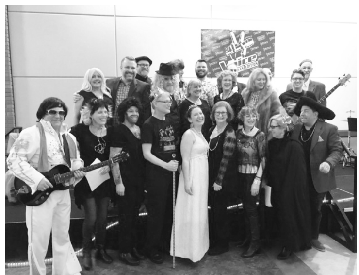
The cast of "The Voice: Shushan Edition"

Share your thoughts and ideas with me at President@bnai-israel.us