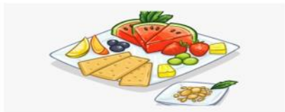
Oneg Shabbat Sponsorship $54.00