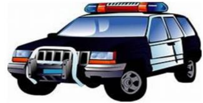
Security Sponsorship One officer $135.00

Sponsorships can be planned in Honor of a special occasion or in Memory of a Loved One Call the Temple office 501.225.9700 or email templesecretary@bnai-Israel.us to reserve your sponsorship date.