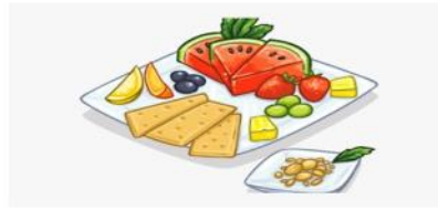
Oneg Shabbat Sponsorship $54.00