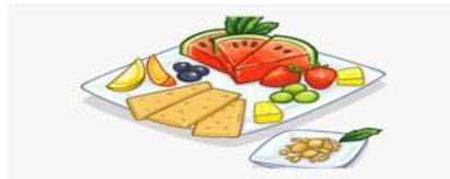
Oneg Shabbat Sponsorship $54.00