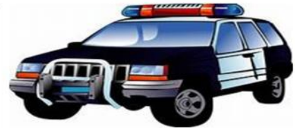
Security Sponsorship One officer $135.00

Sponsorships can be planned in Honor of a special occasion or in Memory of a Loved One Call the Temple office 501.225.9700 or email templesecretary@bnai-israel.us to reserve your sponsorship date.