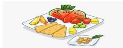
Oneg Shabbat Sponsorship $54.00