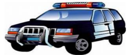
Security Sponsorship One officer $135.00

Sponsorships can be planned in Honor of a special occasion or in Memory of a Loved One Call the Temple office 501.225.9700 or email templesecretary@bnai-Israel.us to reserve your sponsorship date.