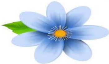
Bimah Flowers Sponsorship $100.00

We are reuniting at Temple for Friday Shabbat Services. Your sponsorship is greatly appreciated.