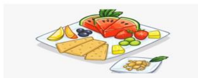
Oneg Shabbat Sponsorship $54.00