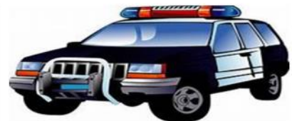
Security Sponsorship One officer $135.00

Sponsorships can be planned in Honor of a special occasion or in Memory of a Loved One Call the Temple office 501.225.9700 or email templesecretary@bnai-israel.us to reserve your sponsorship date.