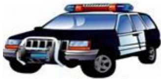
Security Sponsorship One officer $135.00

Your support and sponsorship is greatly appreciated as we gather together for Shabbat and other events. Call our office to sponsor in memory or honor of someone special.