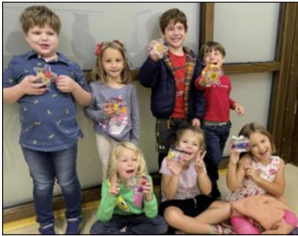
Tzedakah—an act of justice & values