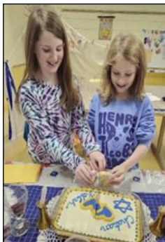
Celebrating a Simcha