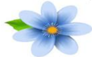
Bimah Flowers Sponsorship $100.00