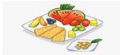
Oneg Shabbat Sponsorship $54.00