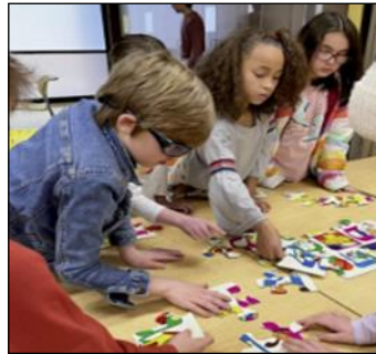
Learning Hebrew together