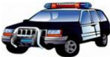
Security Sponsorship One officer $135.00

To sponsor an Oneg Shabbat, Pulpit Flowers, or Shabbat Security detail, just contact our office. Honor someone with this generous mitzvah to your Temple—for safety, beauty, and community.