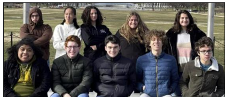
Lobbying our Washington leaders on social justice issues