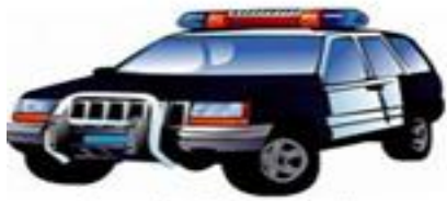
Security Sponsorship One officer $135.00