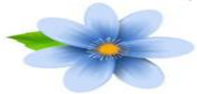
Bimah Flowers Sponsorship $100.00