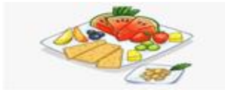
Oneg Shabbat Sponsorship $54.00