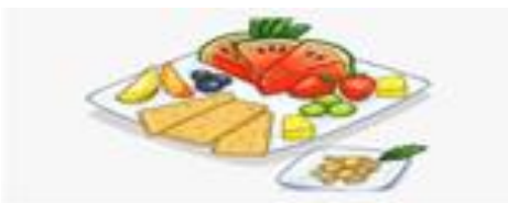
Oneg Shabbat Sponsorship $54.00

Your generous sponsorship ensures we can welcome our community with hospitality, safety and beauty for Shabbat. Call to offer your support for an upcoming Shabbat and occasion.