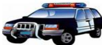
Security Sponsorship One officer $135.00