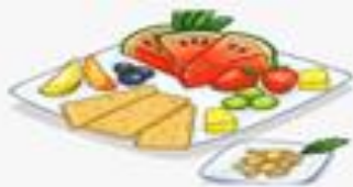
Oneg Shabbat Sponsorship $54.00

Your generous sponsorship ensures we can welcome out community with hospitality, safety, and beauty for Shabbat. Call to offer your support for an upcoming Shabbat and occasion.