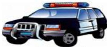
Security Sponsorship One officer $135.00