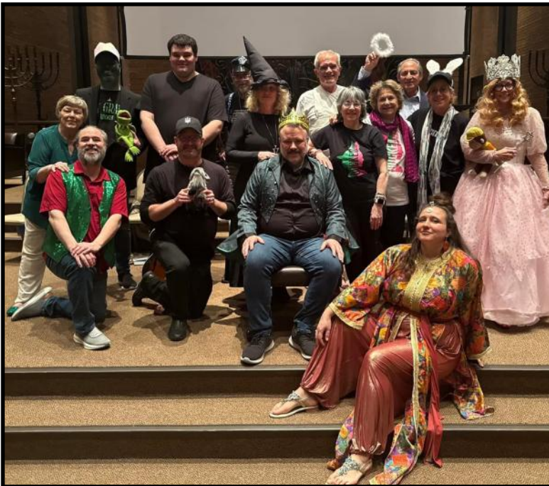
What a Wicked night at the Congregation B'nai Israel Purim Shpiel!