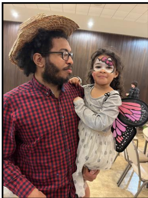
Fun times at the LAFTY Purim Carnival!